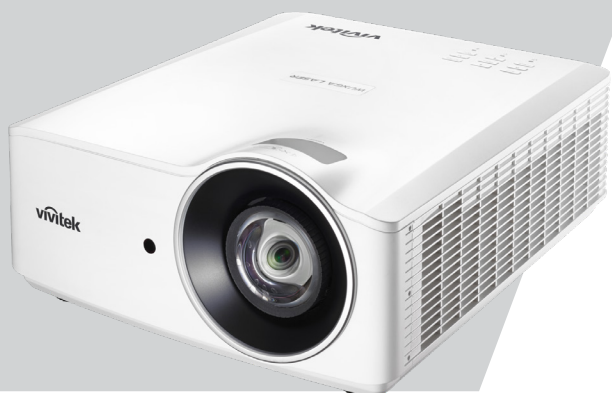
Vivitek DU4371Z-ST laser projector

Vivitek DU4371Z projectors, which are ideally suited to galleries and museum applications - like the Israel Museum – as well as for corporate, education environments. A short-throw projector, the DU4371Z-ST creates quite an impression thanks to its easy and discrete positioning options which can be very close to the projected surface. This versatile WUXGA laser projector offers an impressive picture with brightness of 5100 lumens. Along with 0.5 short throw lens, 360-degree positioning option and optimal thermal management, the projector allows for a picture-perfect installation both in single set up as well as mapping applications.